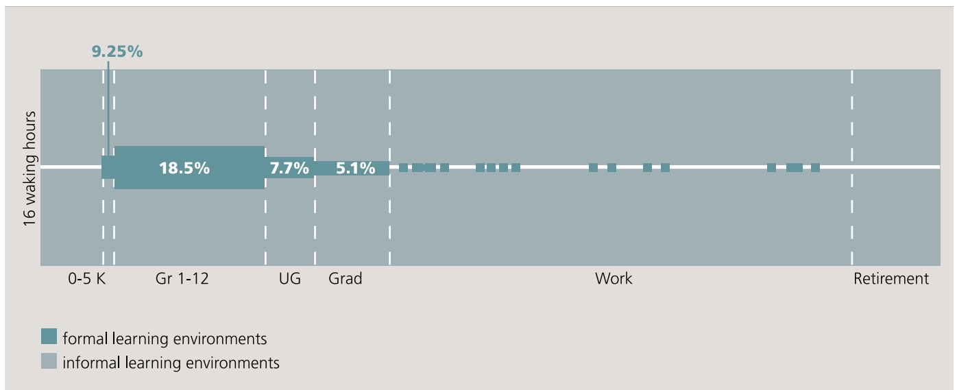
Figure 2. Lifelong and lifewide learning

Not that long ago, people expected to learn much of the information and skills they needed for life and work within the confines of a school day and their years in school. Today, learning must be continuous and lifelong. (See Figure 2.)